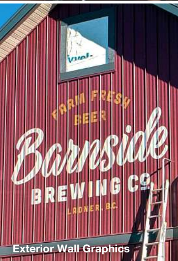
Exterior Wall Graphics