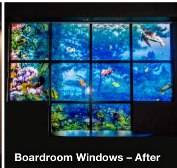
Boardroom Windows – After