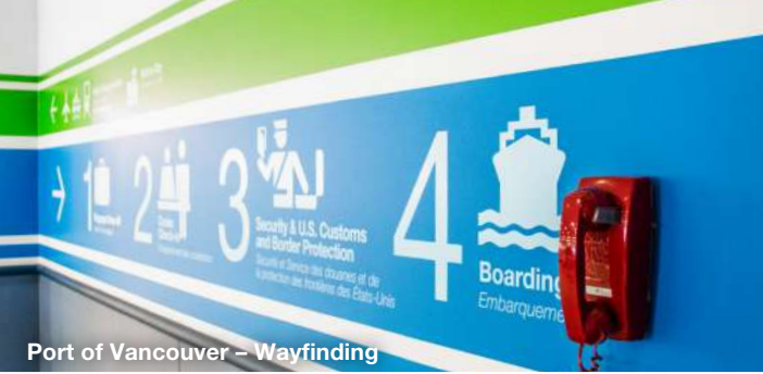
Port of Vancouver – Wayfinding