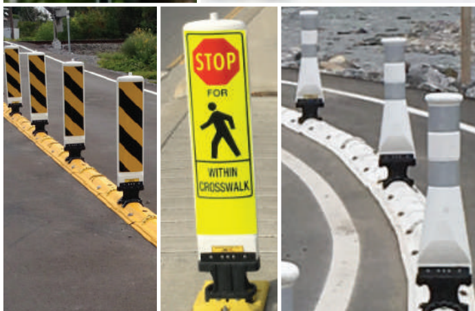
QWICK KURB® Traffic Delineation