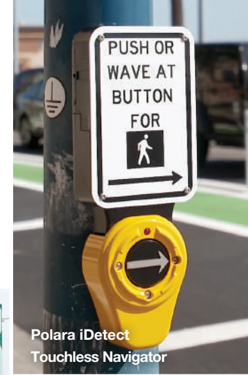
Polara iDetect Touchless Navigator