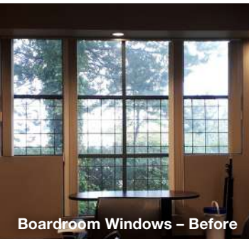
Boardroom Windows – Before